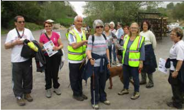
very welcome break at eco Wheelbarrow Farm

The Newmarket, Shortwood, Rockness walk was quite strenuous but most enjoyable. The weather was a bit overcast, so it wasn't too hot. Les led the group with Carole and Basil sort of bringing up the rear.