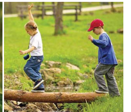
Education and Community

An accessible, attractive space appealing to all ages encourages exercise and provides a social gathering and recreational ground for members of the local community.