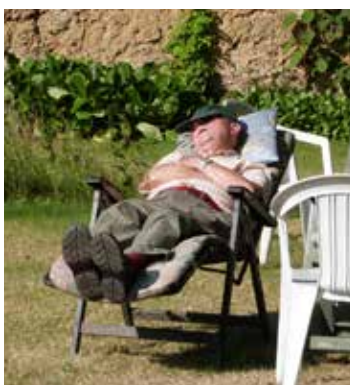
Just time for a quick siesta between activities!