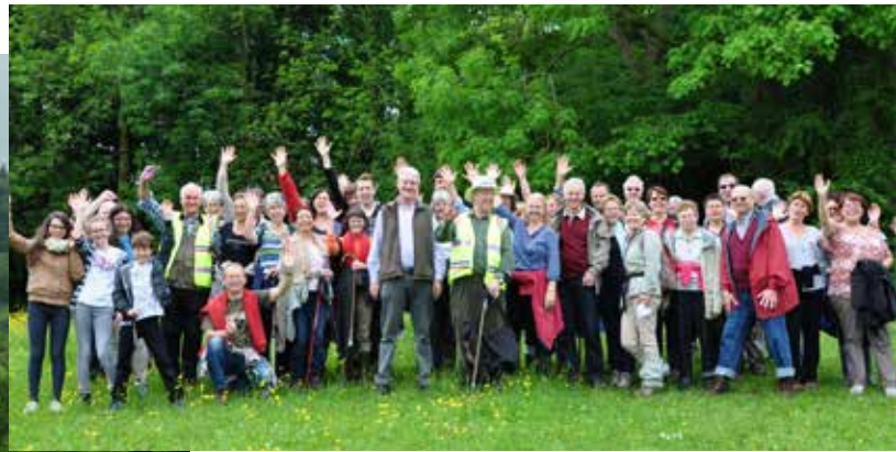
We discovered that our friends from Lèves had never come across a stile before and did not know that in French it is called “un échelier”!