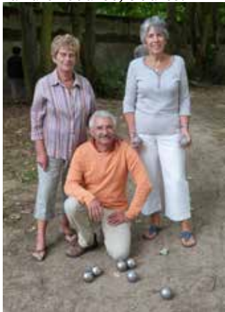
and of course, boules!