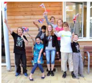
Scorching weekend for the 2012 visit to Nailsworth end of May meant lots of lovely al-fresco entertaining. We had a French art exhibition at the Arkell Centre, bangers & mash supper prepared by Ruskin Mill cooks (rather inappropriate given the heat!) and cricket under a cloudless sky.