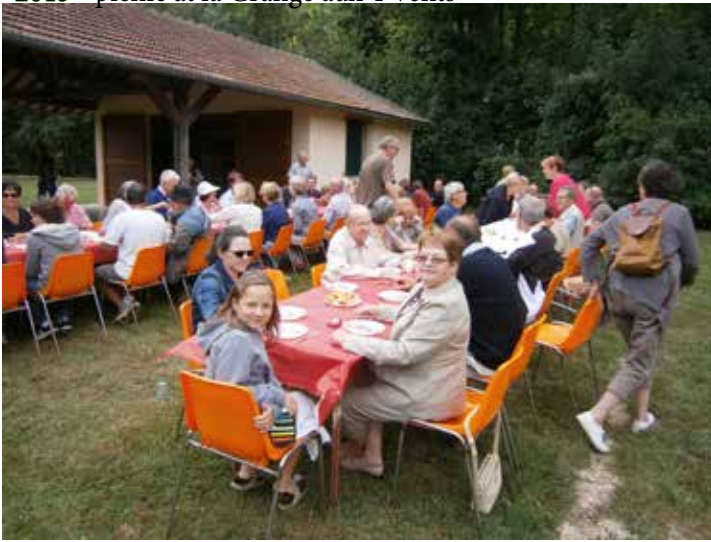
and of course, boules!