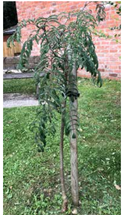
Our 20th anniversary tree seems to be doing OK (photo 16 Sept)