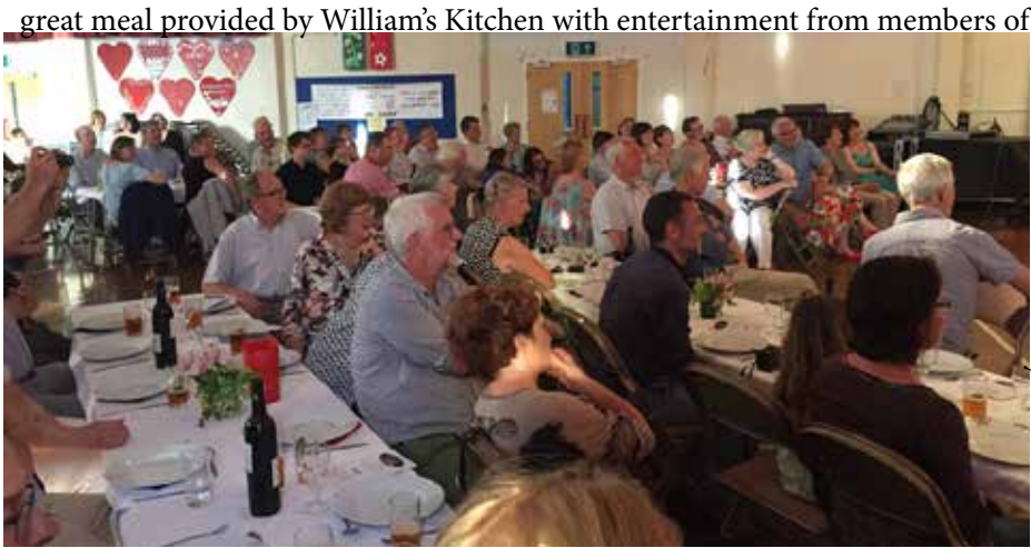
the NW Dramatic Society

A sunny weekend again in Nailsworth in 2018 with several children taking part in the visit. Plenty of outdoor activities and entertaining.