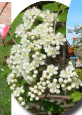
one day, it might even look like this!