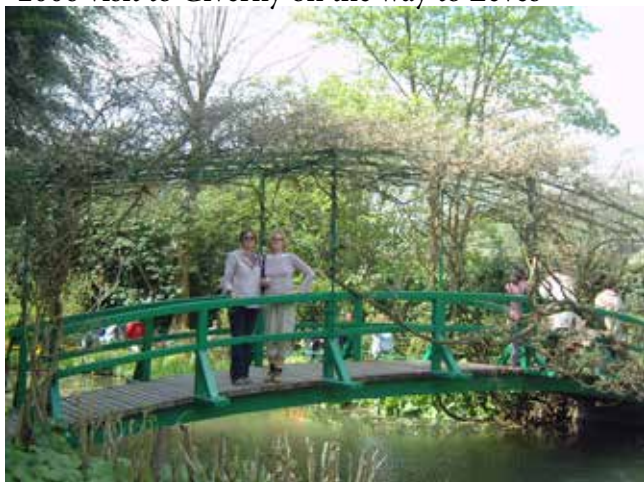
2006 visit to Giverny on the way to Lèves