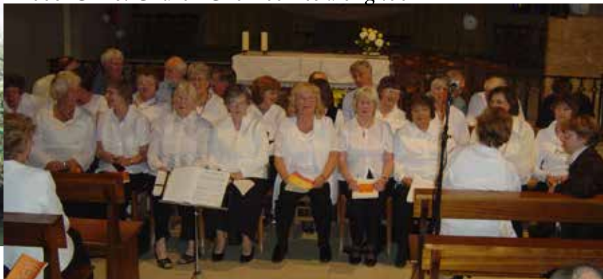
2006 Christ Church Choir comes along too