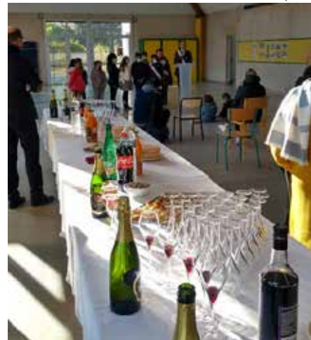
Photo : Le vin d'honneur and the Mayor's speech.

After sparkling wine and nibbles, the grand banquet awaited us at the Espace Soutine. It was quite a feast! After another apéro, there was a starter, followed by fish, followed by meat, then cheese, then a dessert, all accompanied