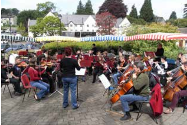
2009 very large visit including Lèves Music School