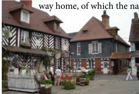
lunch stop at somewhere very picturesque on the way home, of which the name escapes me!