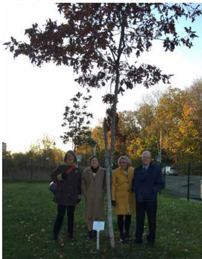
Photo : The tree