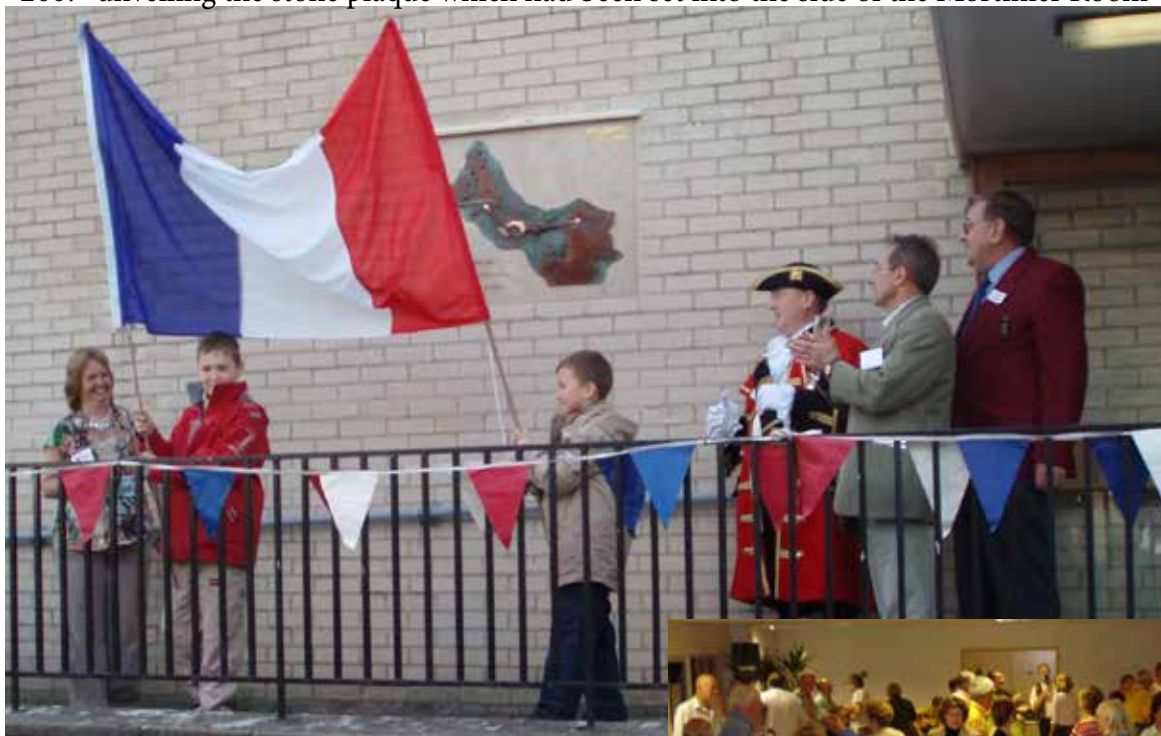
2007 unveiling the stone plaque which had been set into the side of the Mortimer Room