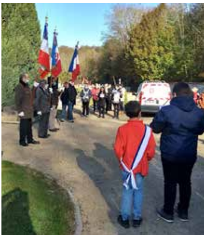
Photo : The standard bearers

The speeches were as moving as ever but were complemented this year by some readings by the Lèves primary school children, showing that they were committed to carrying on the tradition of remembering those who had died